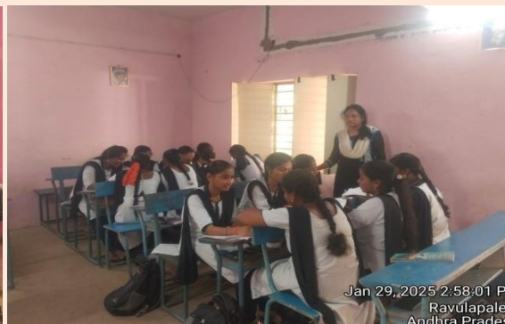
Jan 29, 2025 2:58:01 PM Ravulapalem Andhra Pradesh