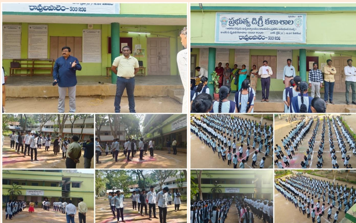
Staff and students at General Assembly