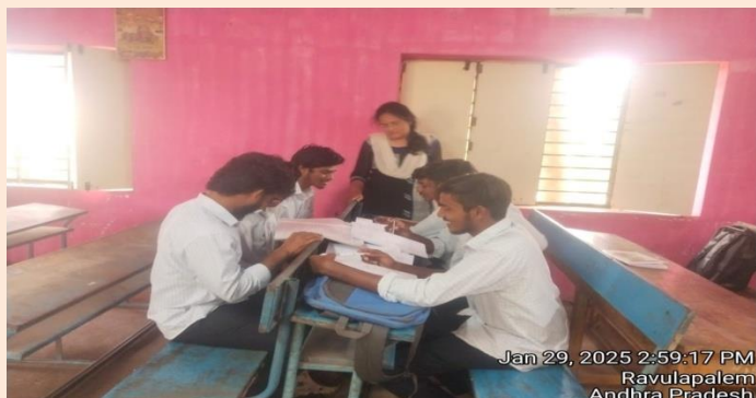
Jan 29, 2025 2:59:17 PM Ravulapalem Andhra Pradesh