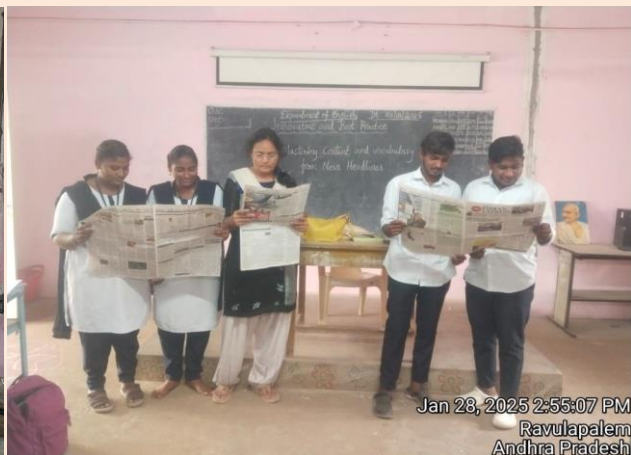
Jan 28, 2025 2:55:07 PM Ravulapalem Andhra Pradesh